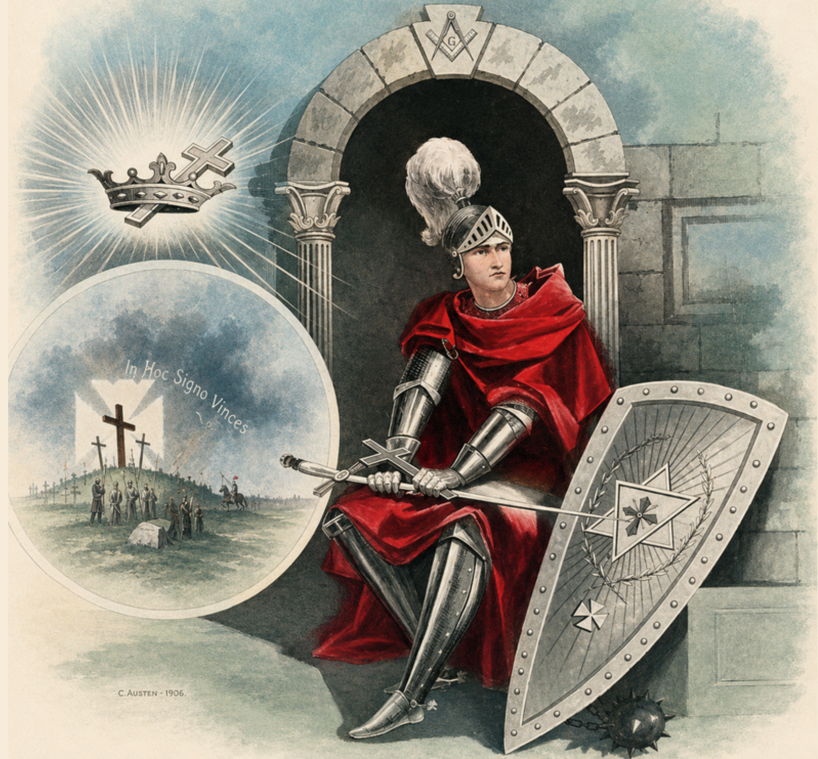
C. AUSTEN - 1906.