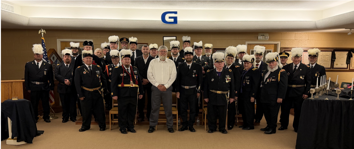
Dickson Commandery #41