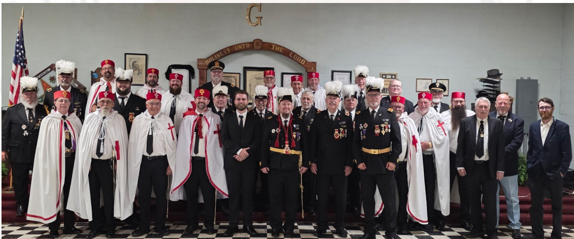
Phillip Lacy Commandery #46