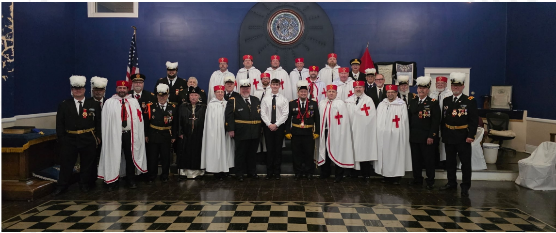
Southwest Commandery #31