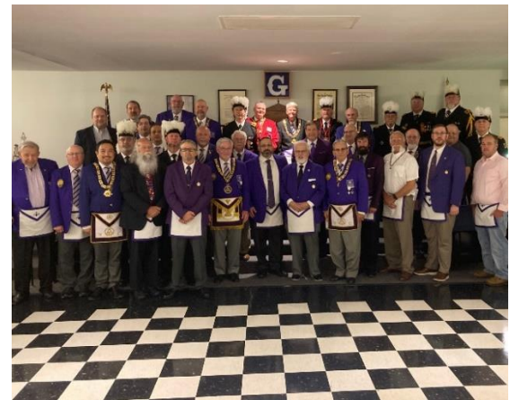
The Raleigh Area Meeting – May 6