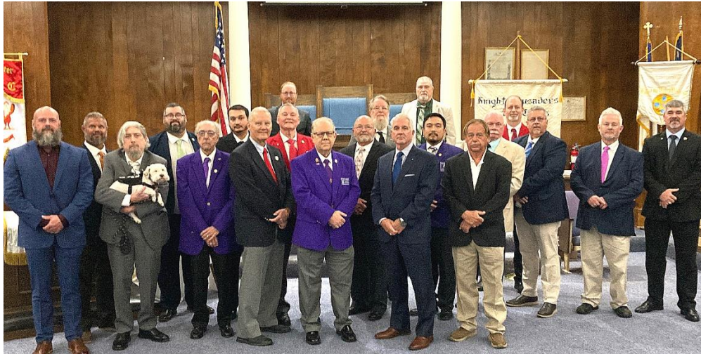
KCC Candidates at Honors Day