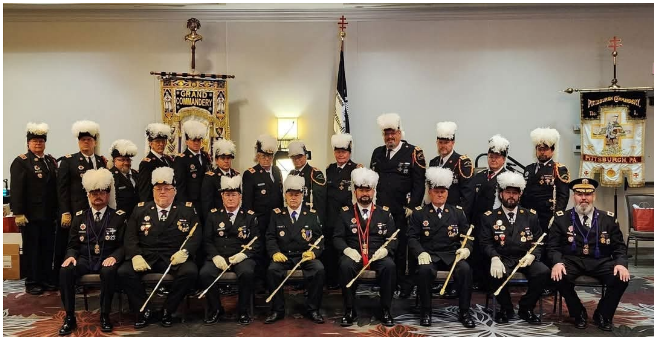
Officers of the Grand Commandery