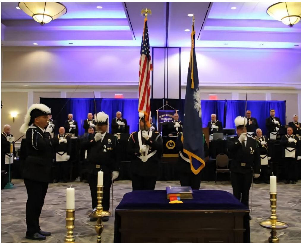
Grand Commandery Color Guard presenting the colors at our Grand Lodge Communication