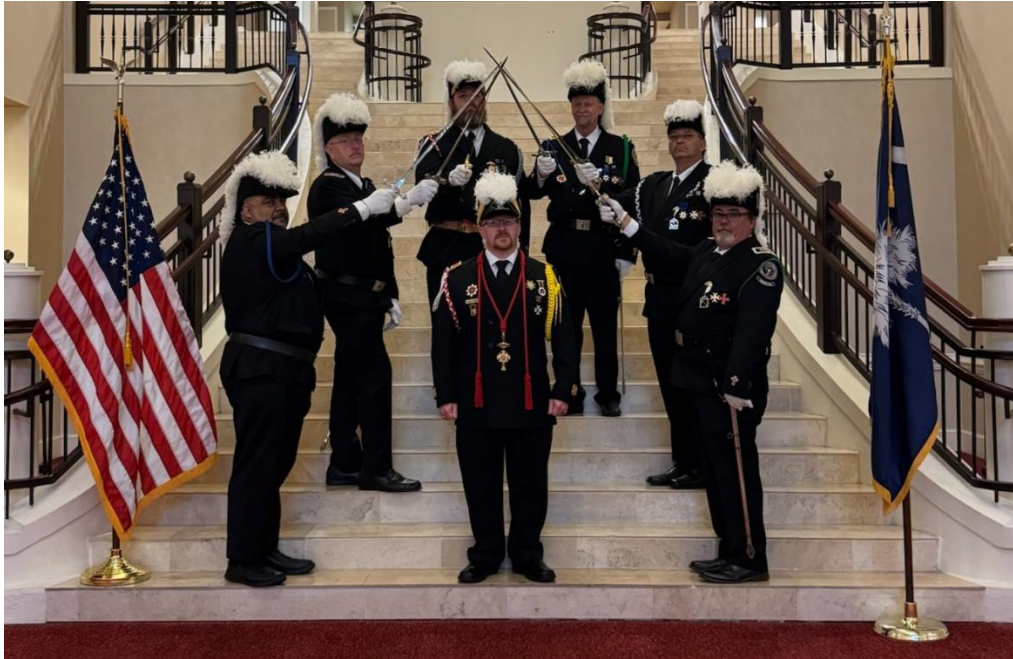
With the Sir Knights of the Grand Commandery Color Guard at our Grand Lodge Communication