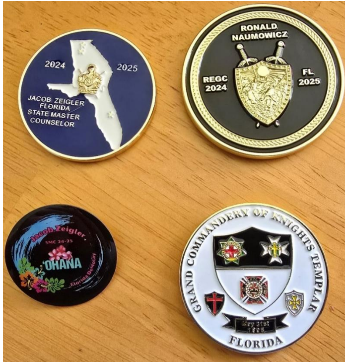
Coins and pin from the GYR Sessions in Florida