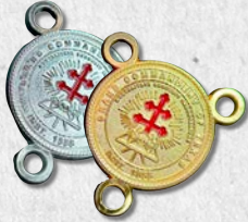
Sword Chain Keeper $25.00 ea