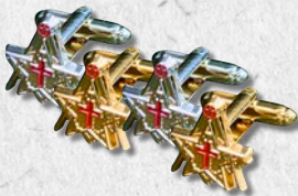
Cufflinks $15.00 a set