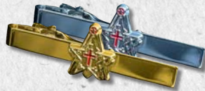
Tie Bar $5.00 ea