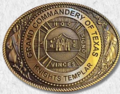
Belt Buckle $30.00 ea