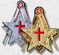
Lapel / Tie Pin $5.00 ea