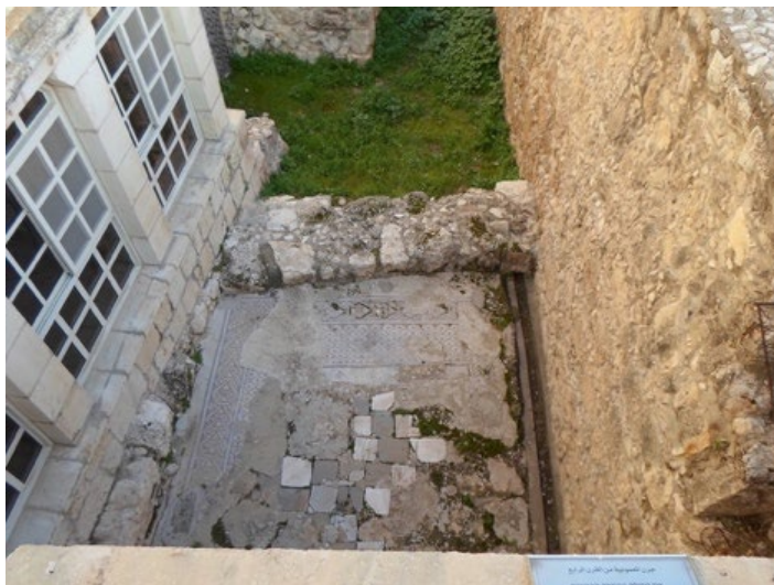
4th Century Baptismal Font at Mt Tabor

As we begin our Lenten preparations, let us be ever mindful of the fulfillment of all things in Jesus Christ, and that in him we have been told everything we need to know. He has pulled back the veil to reveal the glory of God, and he will lead us into that promised land, prepared for us in his eternal kingdom.