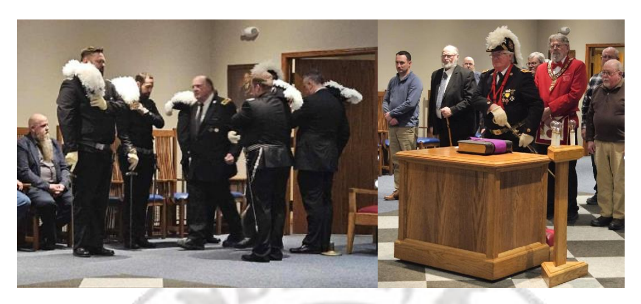
January 20, 2025 . I, along with other Grand Officers of the three Grand York Rite bodies, made a trip to Cedar Falls to make the final plans with our event coordinator for our Annual Grand Sessions. A General Order was just released on the "Call to Conclave" and the schedule, hotel booking, and event registration will be up on the Iowa Grand York Rite website for you to make your plans.