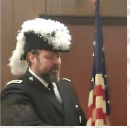
Des Moines. Installation of York Rite Officers