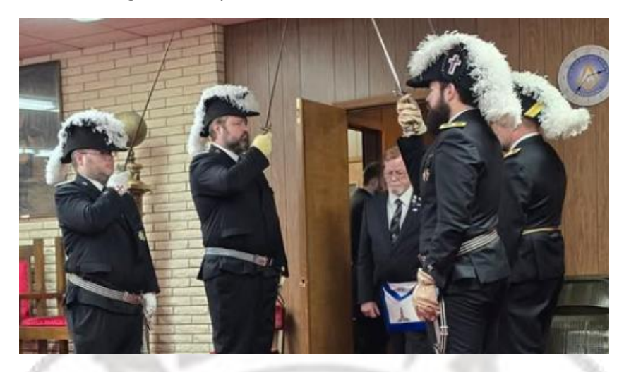
Iowa York Rite Flag Ceremony and Salute to Newton Lodge Officers