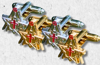
Cufflinks $15.00 a set