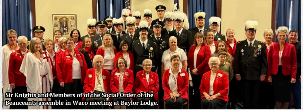
Sir Knights and Members of of the Social Order of the Beauceants assemble in Waco meeting at Baylor Lodge.