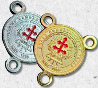
Sword Chain Keeper $25.00 ea