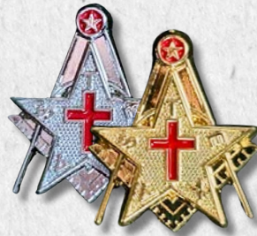
Lapel / Tie Pin $5.00 ea