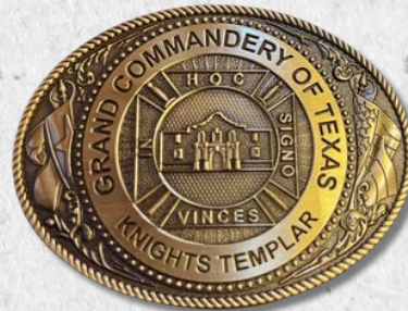
Belt Buckle $30.00 ea