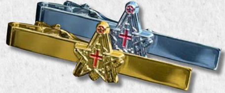
Tie Bar $5.00 ea