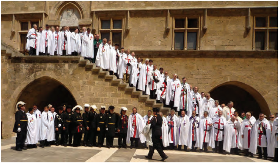
American & Greek Knights in the courtyard of the palace in Rhodes.