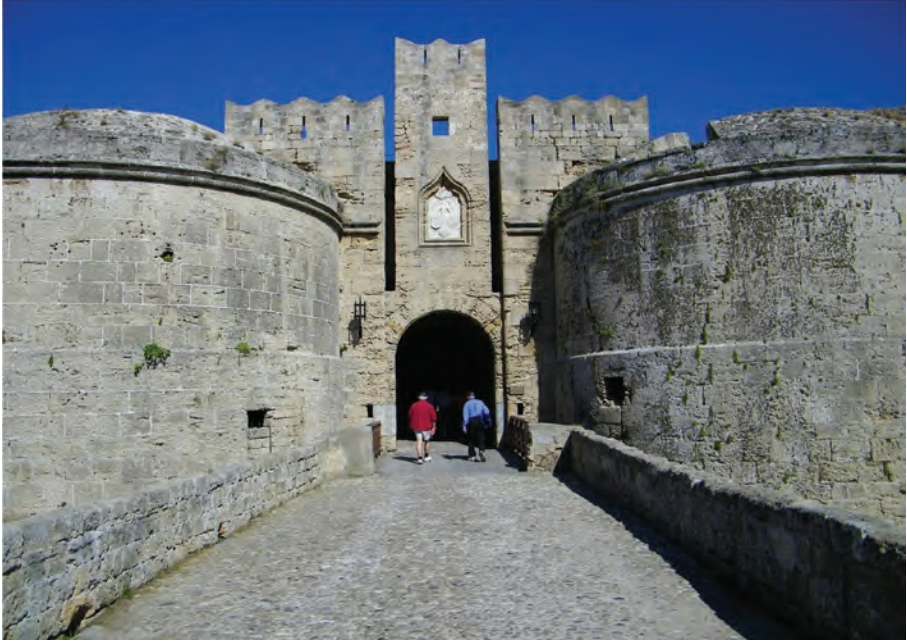
Elevated entrance to the Grand Master's Palace in Rhodes.

F rom April 22 nd to May 6 th of 2009, the Grand Commandery of Knights Templar and the Appendant Orders of Massachusetts and Rhode Island and Boston Commandery No. 2, Knights Templar made a special Pilgrimage to Greece and Rhodes. The following is a brief report of that sojourn.