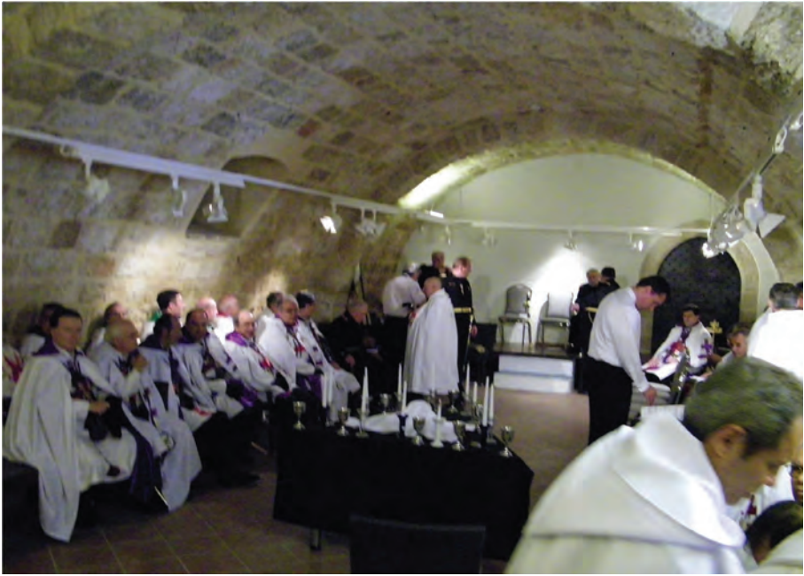
The Order of the Temple was conferred in the same room as ancient knightings.

ning shades decline and you near the end of your own pilgrimage from Nazareth to Jerusalem, from Alpha to Omega, and as you peer down into the sepulcher which was prepared for you, do not be afraid. Remain faithful. Stretch forth your hands, and be welcomed into the joy of our Savior and Lord, Jesus Christ.