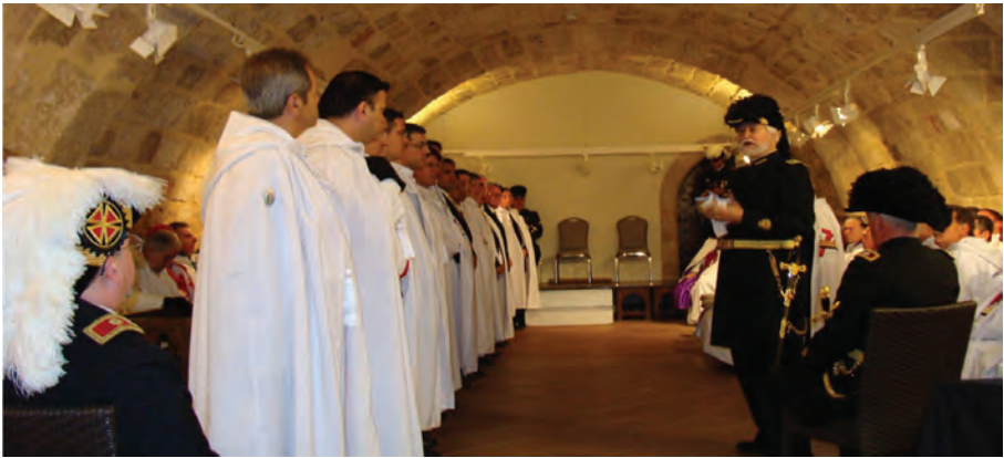
Boston Commander delivers the final exhortation.

and landed the following day. Arriving in Athens, they had several days to see such sites as the Parthenon, the ancient Agora, and the National Museum. Special day trips were made to the Oracle at Delphi, City of Mycenae, and the walled city of King Agamemnon.