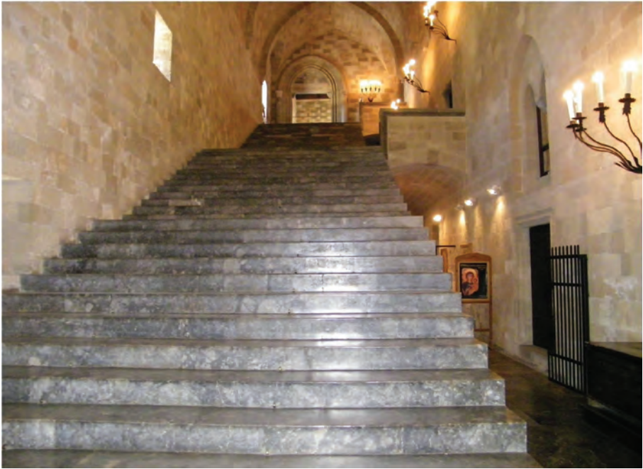
Stairway leading to the upper palace apartments.

mander made the following extemporaneous final exhortation: