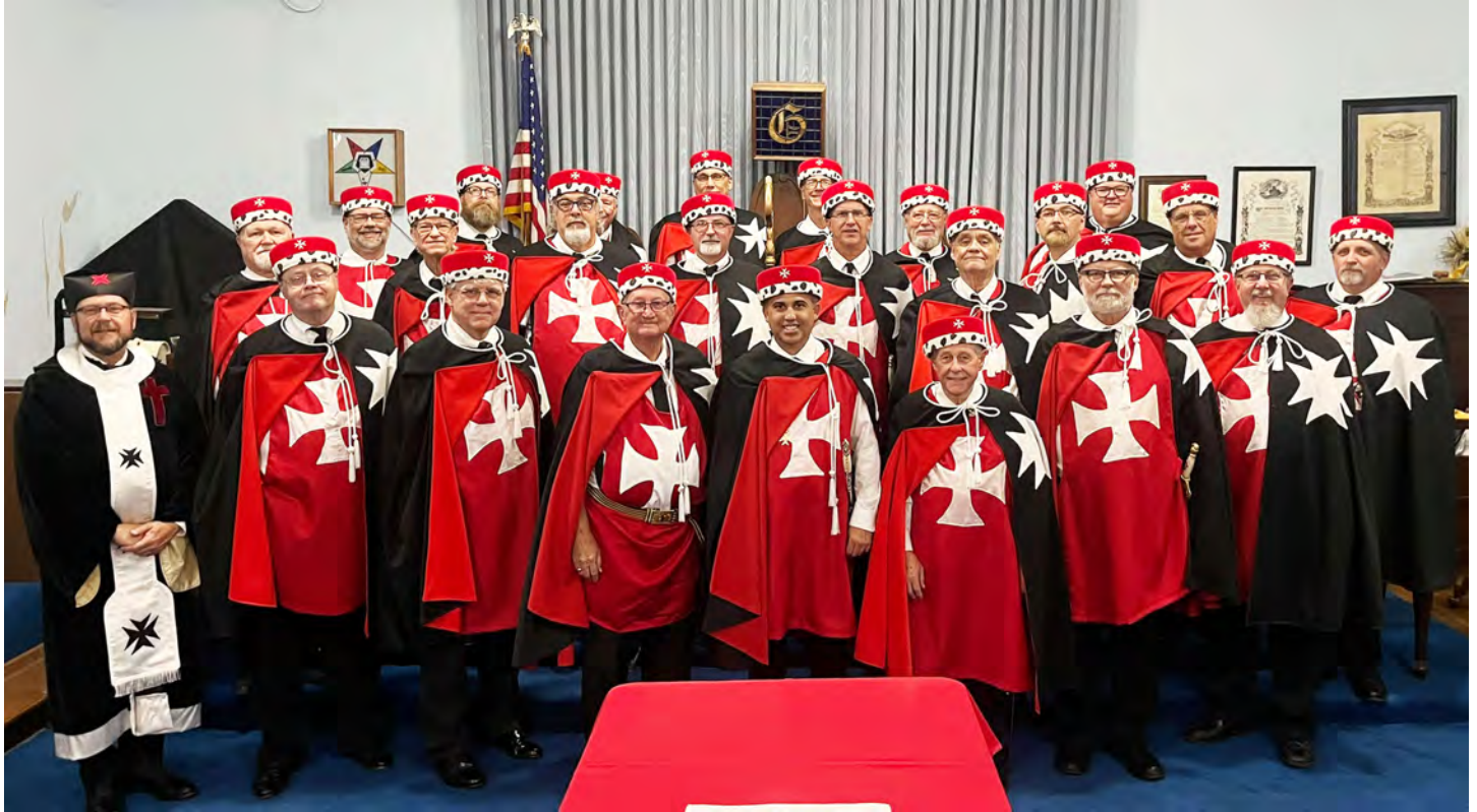
Order of Malta conferral by DePayens Commandery #11