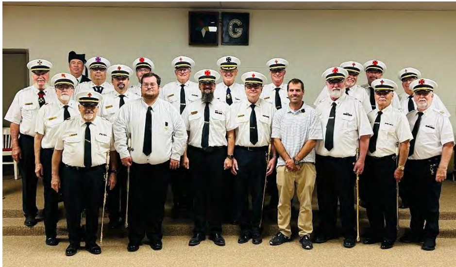
GUTHRIE INSPECTION No. 1