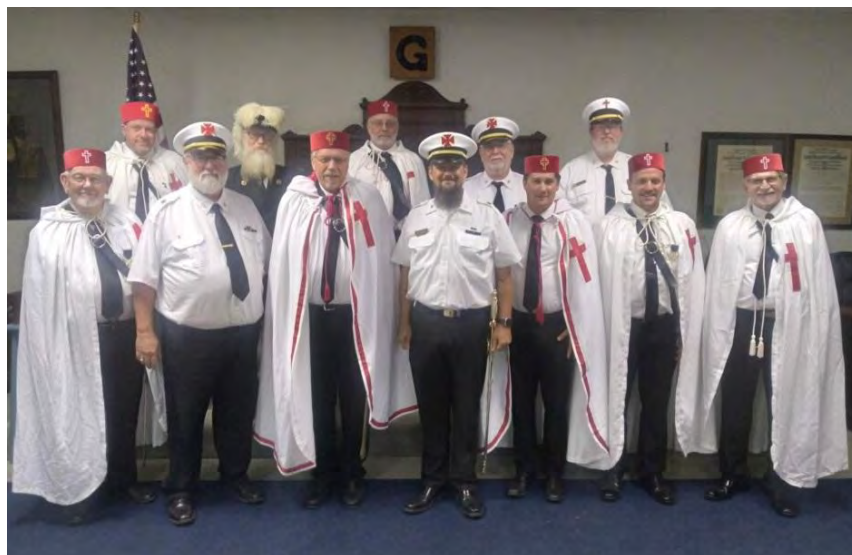
MCALESTER RECEPTION No. 9