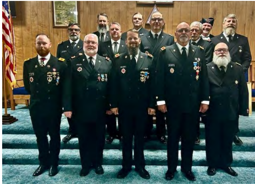
LAWTON INSPECTION No. 18