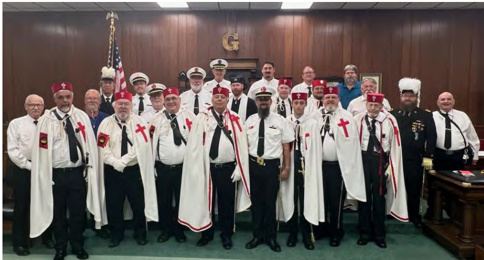
OKLAHOMA CITY RECEPTION No. 3