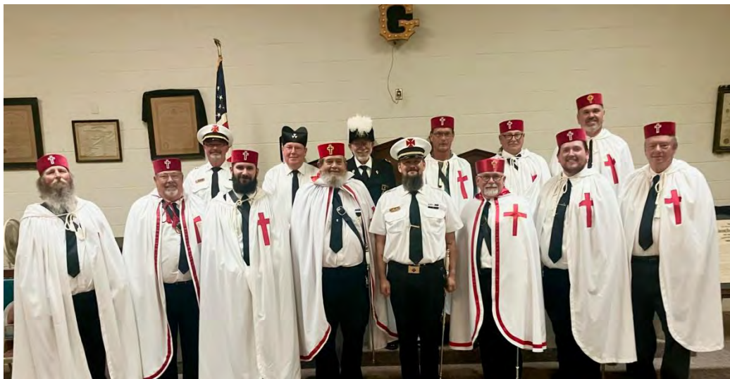
ARDMORE RECEPTION No. 9