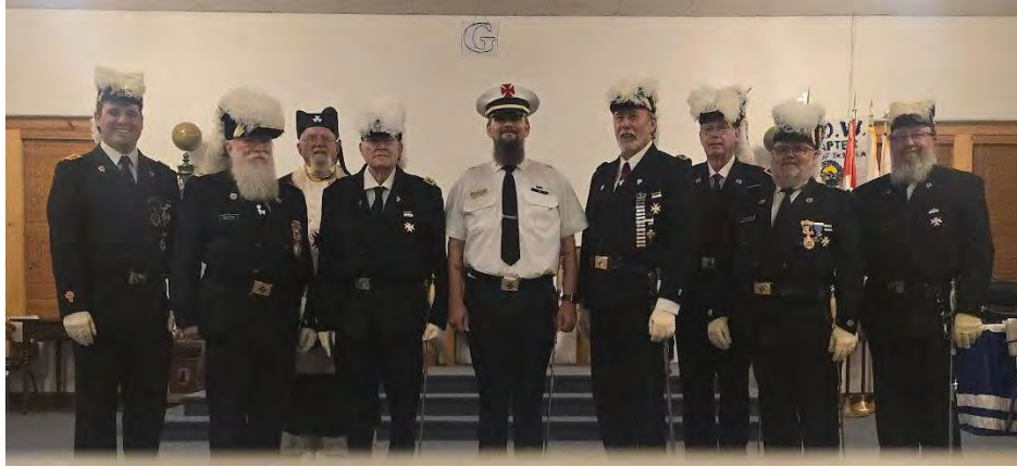
ELK CITY RECEPTION No. 22