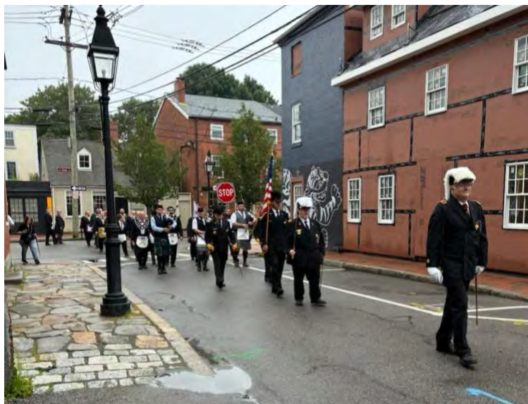
The procession to Saint John's Church on Saint John's Day.

Last month I wrote of the Saint Johns Day observance at the Cathedral of the Pines in Ringe. There was a like, long-standing observance taking place in Portsmouth the same day, as the Masons of Saint John's Lodge No. 1 marched to Saint John's Episcopal Church, accompanied by pipers and several officers of the Grand Lodge and led by Sir Knights of DeWitt Clinton Commandery. Please forgive the oversight. No slight of the Portsmouth observance was intended.