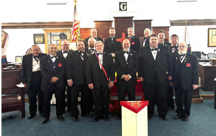
New Knight Companions and Officers of Granite State Conclave in Tilton

Commemorative Order of Saint Thomas of Acon and Granite State Conclave, Knights of the Red Cross of Constantine held their annual meetings the last Saturday of July.