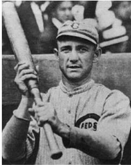
Heinie Groh with his "bottle bat."

For the 1911 season, he played first for Decatur in the "Three I" League until July when the New York Giants purchased his contract and assigned him to Buffalo, where he hit .333, and the Giants brought him up to the parent club in 1912.