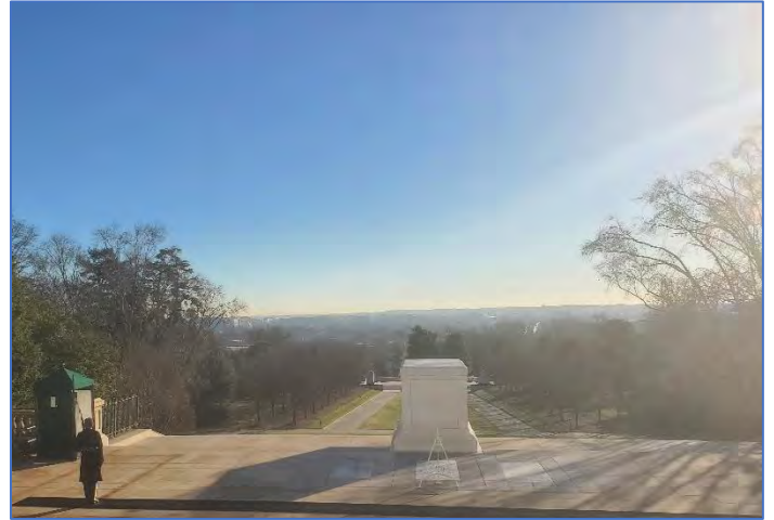
A beautiful day at Arlington Cemetery to reflect on the sacrifices made to protect our Republic and the blessings of Liberty we enjoy.