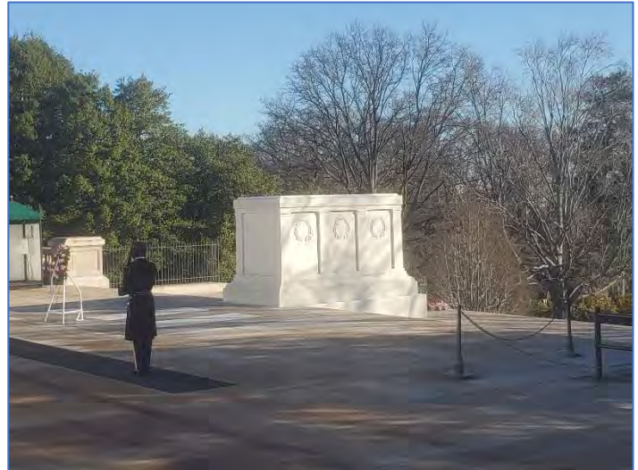
The Tomb is guarded day and night in all weather by faithful guards.