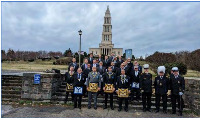
Members of the Grand Lodge of NC and Nazareth Commandery #41 at the George Washington National Masonic Memorial

Southern Pines - Early Sunday morning, February 19th, several members of Nazareth #41 and guests boarded a train for Alexandria, VA, arriving safely later that day. Monday morning, the group toured the Scottish Rite House of The Temple, home of the Scottish Rite Southern Jurisdiction. After the tour they returned to the hotel to get ready for the parade through historic Alexandria, celebrating the 100th Anniversary of the Laying of the Cornerstone of the George Washington Masonic National Memorial. Following the parade, they watched the re-enactment of the Laying of the Cornerstone.