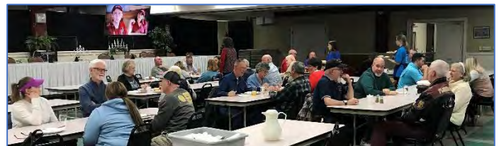
Guests enjoyed the ham supper and raised funds for our Charities.

In a nod to the ongoing concerns regarding COVID, the bodies tried something new this year: pickups and deliveries of pre-ordered meals. The residents at Whitestone took advantage of this new service as well as our in-house dining hospitality, as did several members of the public, including our law enforcement friends and brothers.