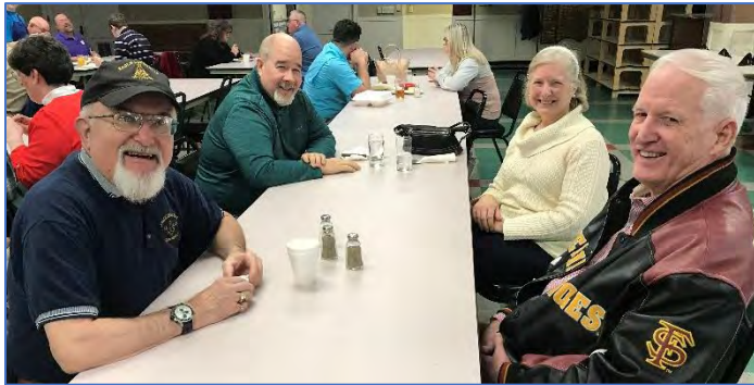
Members of Eagle Lodge #19 in Hillsborough drove in to enjoy dinner and contribute to the cause.

to the ‘new normal’ and continue to raise money for our charities, as well as have a great time as a group doing so. I’m happy to see that this event is returning to Greensboro, and I’m looking forward to even better participation next year!”