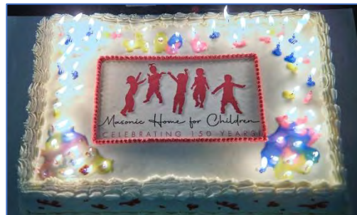
Cake served to commemorate 150 years of MHCO

On February 11, I had the honor of attending the kickoff dinner at the MHCO celebrating their 150 th anniversary, hosted by the Scottish Rite Masons of N.C. If you were not in attendance, then you really missed out on a great event. I'm very proud to say that this event was "SOLD OUT!" The cafeteria at the Home was magically transformed from a dining room for the kids, into a 5-Star Hotel Ballroom.