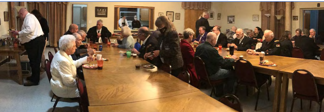
Families and guests of Durham #3 enjoy homemade refreshments after the Christmas Observance