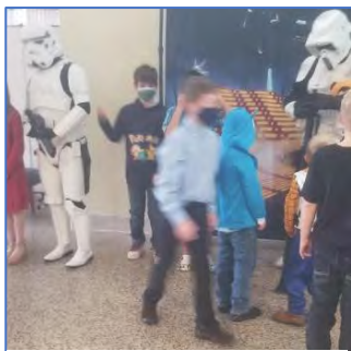
Star Wars characters are a hit!

The children had a great time at their luncheon on Saturday December 10 and got to spend time with ol' St. Nick himself. They had a great luncheon prepared, which was enjoyed by all. I get a little emotional every time I get around "our" kids.