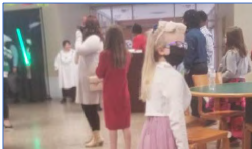
Children at MHCO enjoying the luncheon

I hope this finds you well and happy. Our Lord was most gracious this year to allow the Grand Commandery of N.C. to do the Christmas program for the children at our home in Oxford. It was well attended. I wish to personally thank all the Knight Templars who were there to participate in this event.