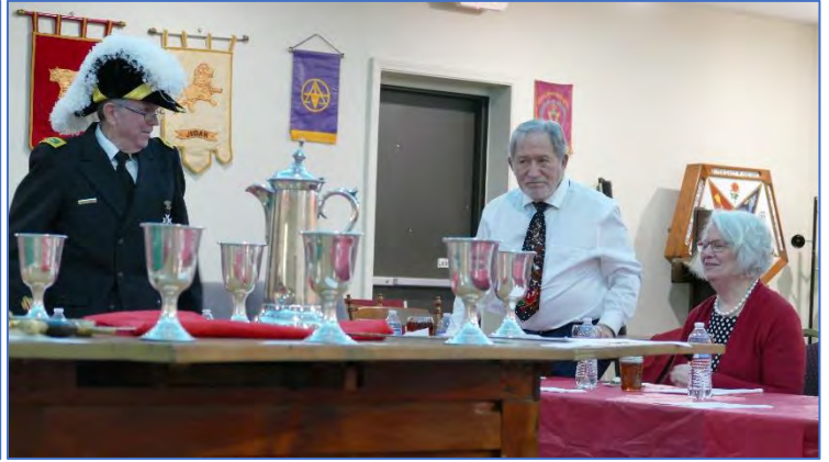
Members and families gather for Charlotte's Christmas Observance on December 18