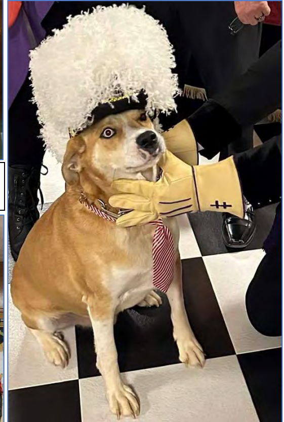
Looks like Wilkes Commandery #40 has gone to the dogs! Good boy, Sir Knight! Good boy, indeed!