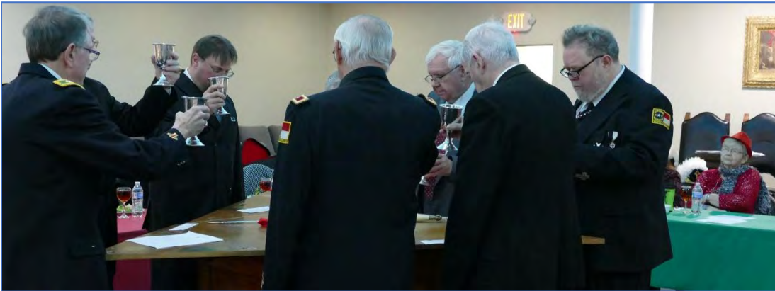
Officers and Sir Knights of Charlotte #2 Toasting the Season