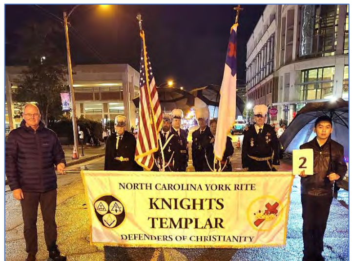
Plantagenet Commandery #2 and Demolay members marched in the Wilmington Parade

Wilmington – On December 11, 2022, Plantagenet Commandery # 1 led the 2022 Wilmington NC Christmas Parade, carrying our National Ensign and Commandery Banners.