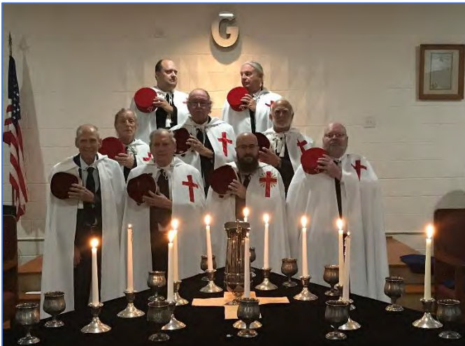
Durham #3 is the only Cap-and-Mantle Commandery in NC; their Christmas Observance was held on December 1 at University Lodge in Chapel Hill