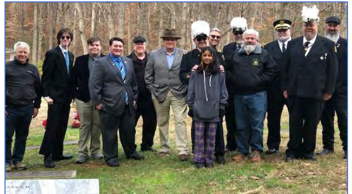
Sir Knights and family gathered to place wreaths on veterans' graves on December 17

outside the Sylvan Abbey Mausoleum at Forest Lawn East Memorial Park to participate on the annual Wreaths Across America event.