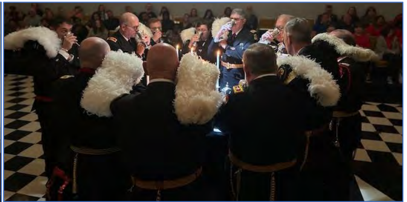
Officers and Sir Knights of Ivanhoe #8 perform the traditional toasts at the Greensboro Masonic Temple, December 7