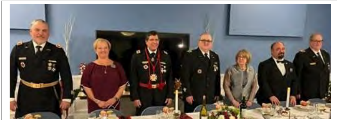
United Commandery No. 21