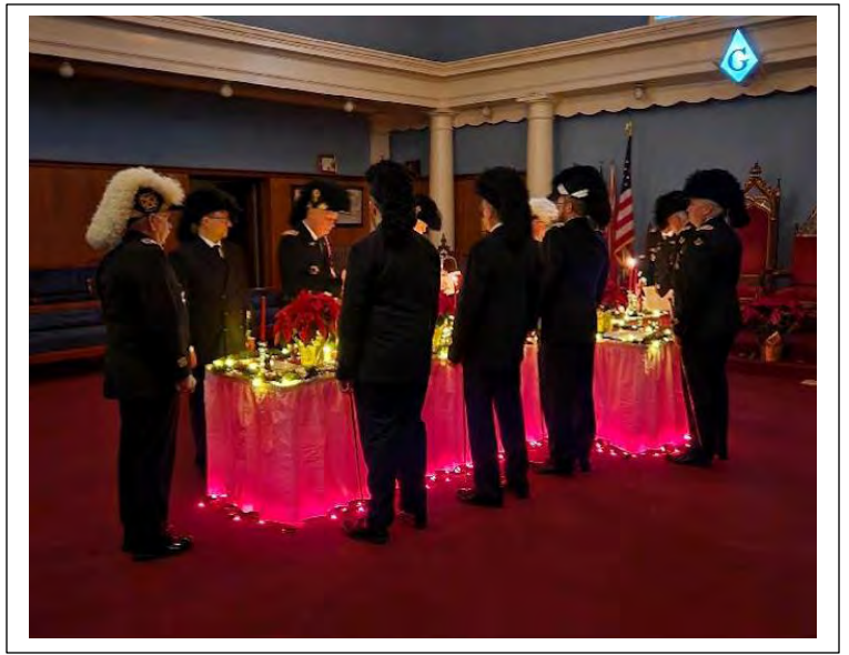
Milford Commandery No. 11