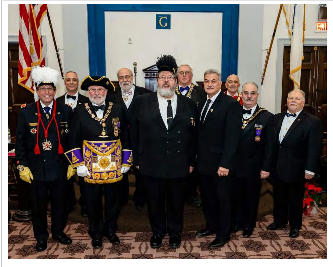
Holy Sepulchre Commandery No. 8