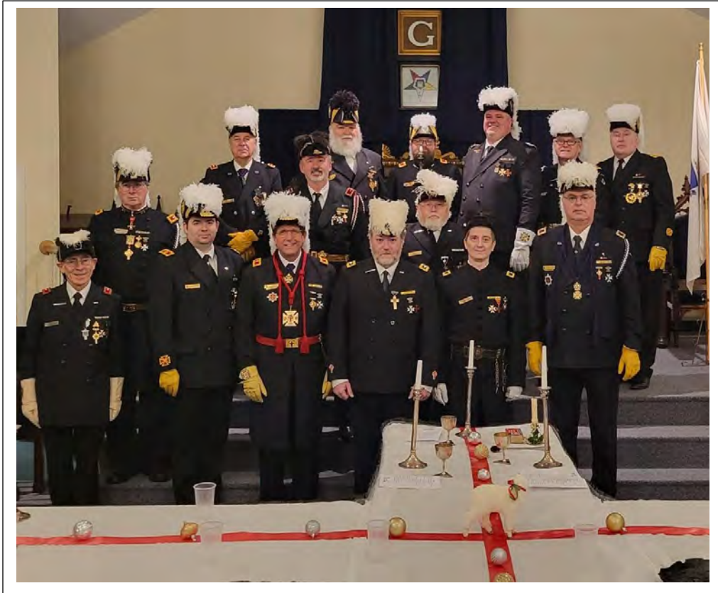
Springfield Commandery No. 6