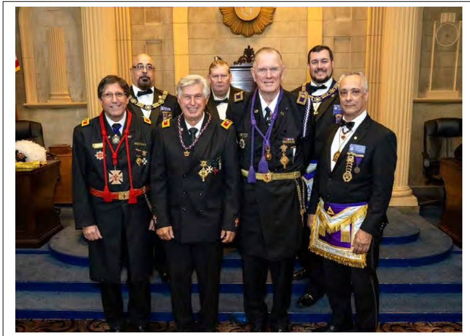
Godfrey de Bouillon-Washington Commandery No. 4 Sutton Commandery No. 16