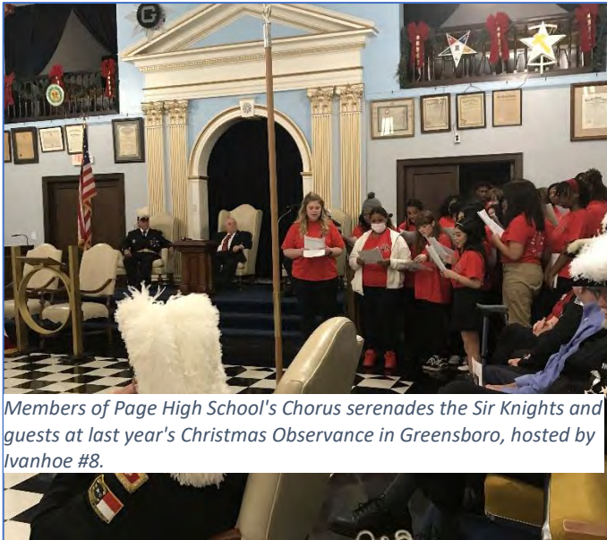
Members of Page High School's Chorus serenades the Sir Knights and guests at last year's Christmas Observance in Greensboro, hosted by Ivanhoe #8.