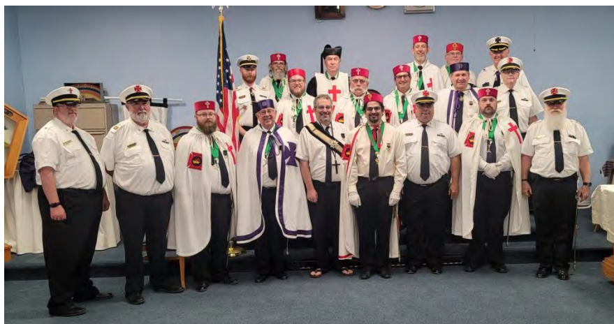
St. Johns Commandery Inspection