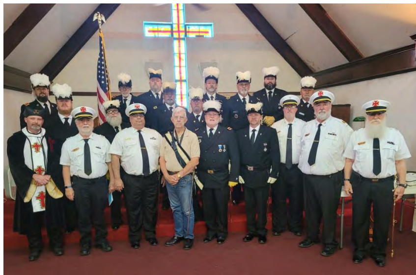
Lawton Commandery Inspection