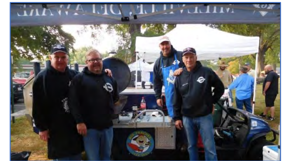
The "Big Peaches" BBQ Team from Doric Lodge #30, Millville, DE