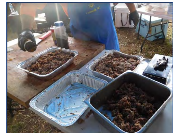
A member of Adoniram #149, Cornwall, NC, seasons a pan of delicious BBQ