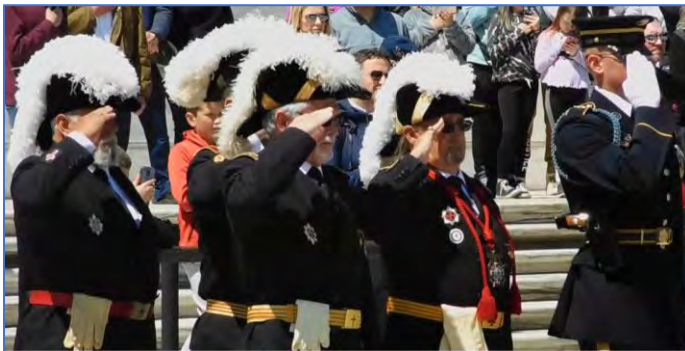
The Grand Commander and Sir Knights at the wreath laying ceremony

There was Silence and Respect from all in attendance.