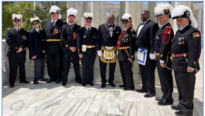
North Carolina Grand Commandery Knights and brothers from Fidelity #10 PHA in San Diego enjoying fellowship and brotherhood.

We met two Prince Hall brethren who had traveled from Fidelity Lodge #10 in San Diego to also lay a wreath. We were pleased to share the event with our fellow travelers and brothers from the west coast of our great Republic!