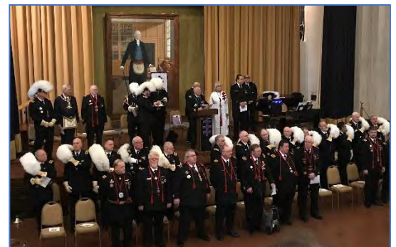
Grand Encampment Officer and Grand Commanders at the Easter Sunrise Service