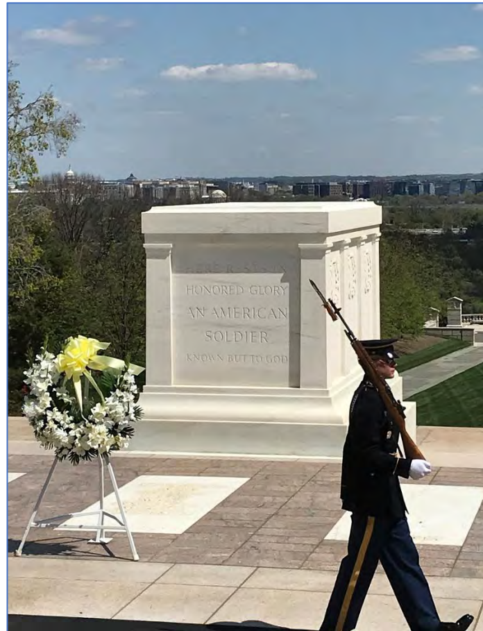
One of the Tomb Guards keeping watch over the Tomb of the Unknown Soldier