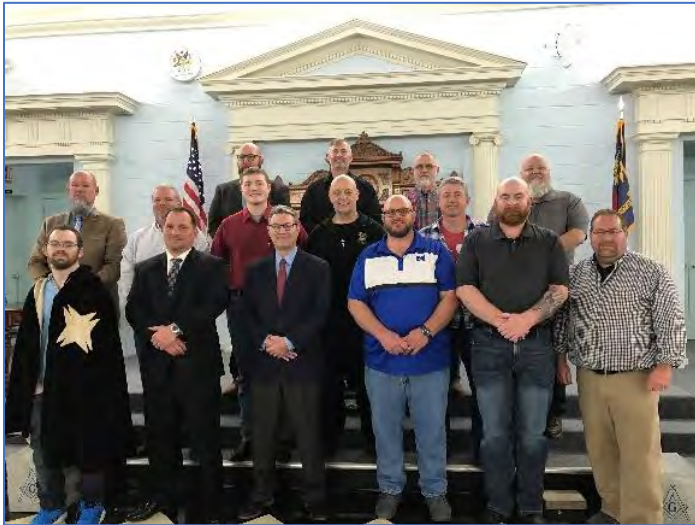
The 15 new Sir Knights hail from 4 Commanderies

Salisbury – On Saturday, February 26, the Salisbury York Rite Bodies held their Spring Festival. A total of 15 candidates were present for the degrees from Mark Master to the Order of Malta.