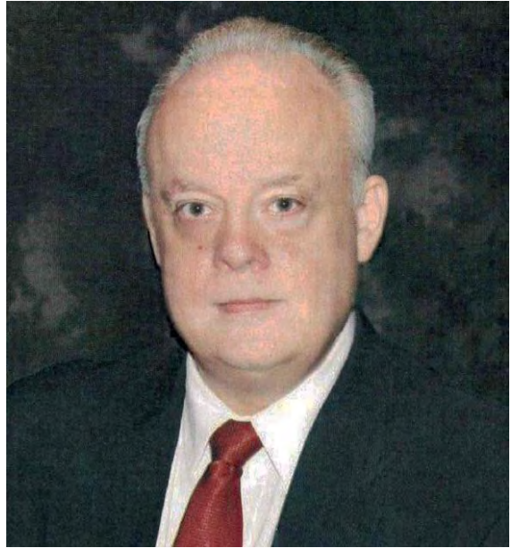
April 10, 1959 - February 4, 2022