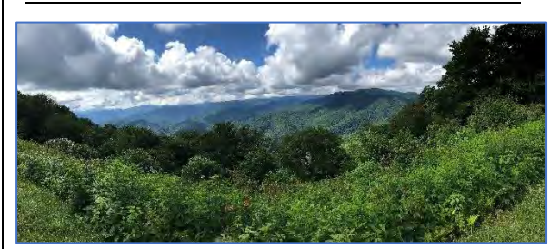
Overlook at Mile-High Gap, Great Smoky Mountains, NC