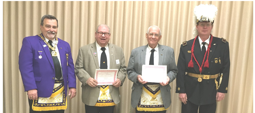
50 Years of York Rite Freemasonry