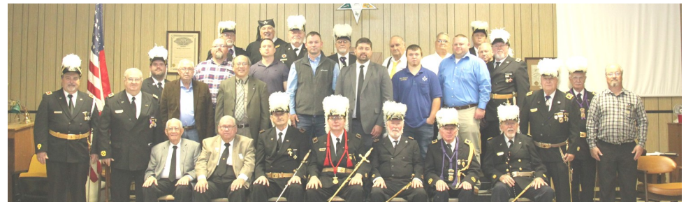
Laurel/Meridian Joint Fall Festival